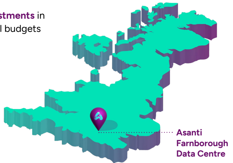
Asanti Farnborough Data Centre

Our extensive Investment Plan reflects our commitment to providing high-quality facilities and services over the long term - that adapt to market trends and changing customer needs. By choosing Asanti, you benefit both now and in the future .